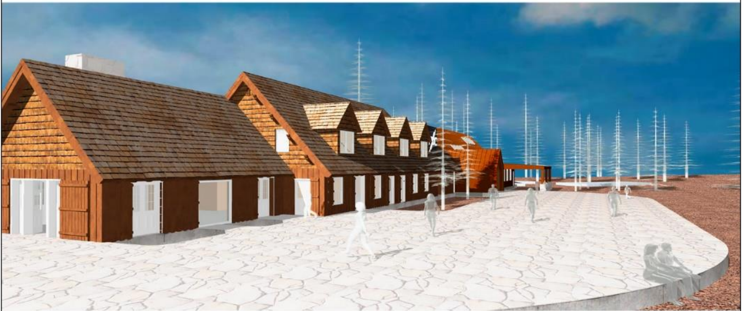
Tahoe Cross Country Ski Area—Back for Site A - full project, Site D - full project, and Site D - alternative driveway.