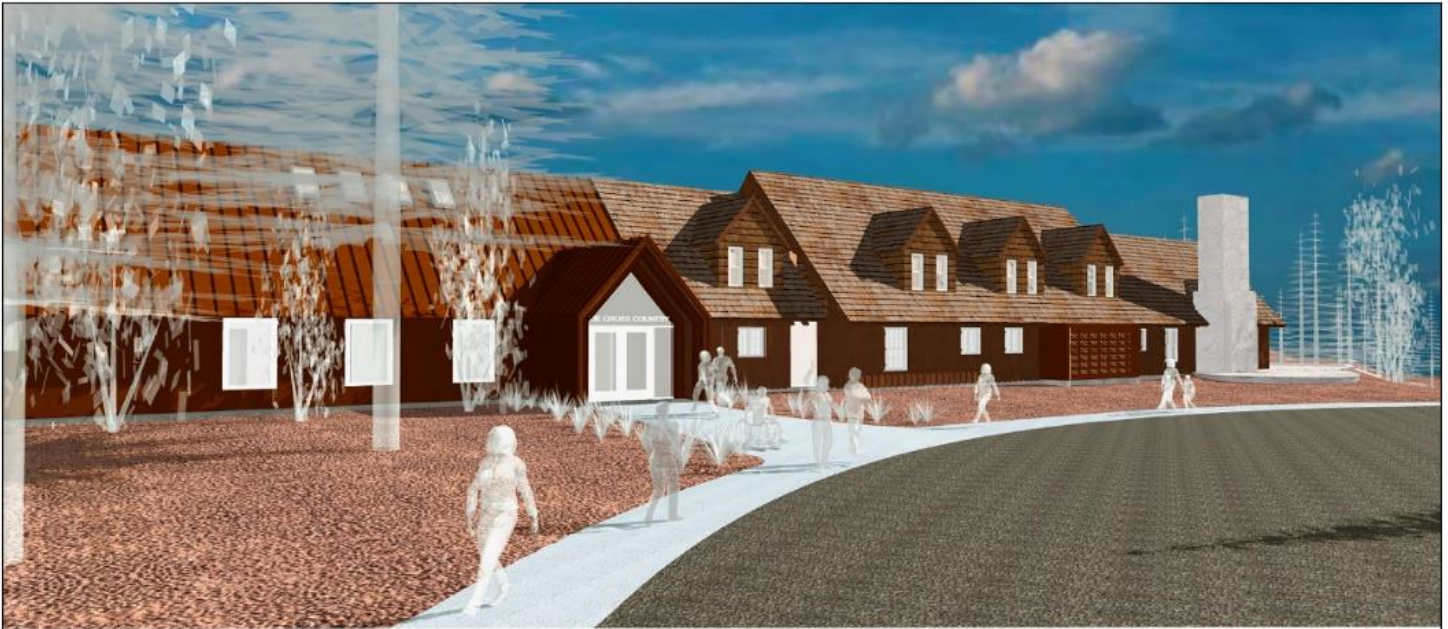
Tahoe Cross Country Ski Area—Site A - full project, Site D - full project, and Site D - alternative driveway.